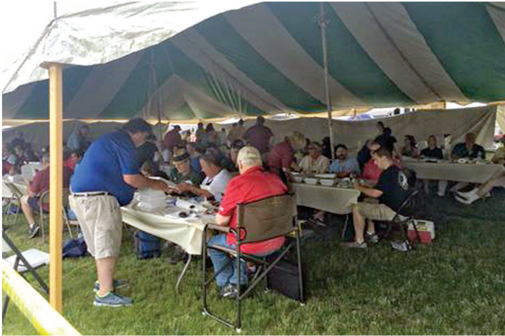
Judges for the 2016 Que for the Troops enjoy the offerings at this year's event.