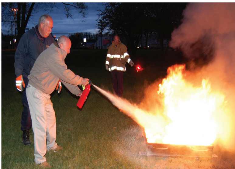
Live fire extinguisher training is part of the Citizens Fire Academy.

We finished our second Citizens Fire Academy in June, which I believe went very well. We worked out some kinks from our first one, so this time it went much smoother. We ran five sessions, which consisted of learning the requirement to be a firefighter in Pennsylvania, live fire extinguisher training, first aid/CPR/AED training, a demonstration of various emergency services equipment available in Falls Township, and a fire inspection of a local restaurant and hotel to teach participants what they should look for when working and traveling in terms of safety.