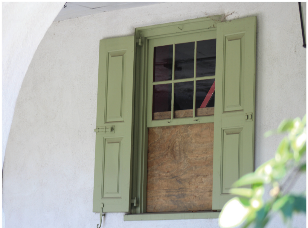
Phase one of the restoration was reproduction of the first floor shutters.