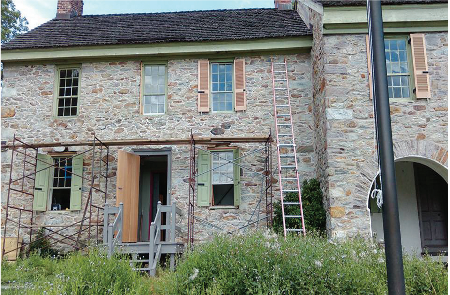
The 300-year-old building was the focus of restoration efforts by a Chester County-based company.