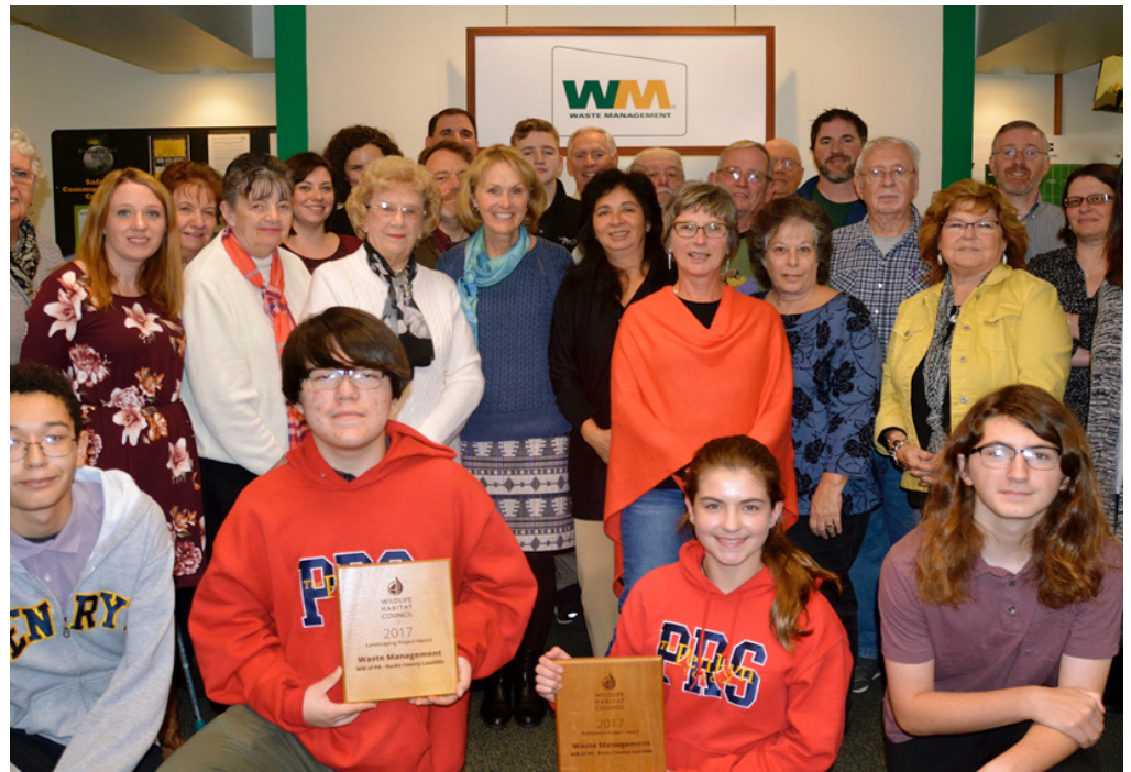
Representatives from The Pen Ryn School, Pennsbury Manor and the Falls Township Senior Center Garden Committee joined employees of Waste Management PA to celebrate the recognition of the intergenerational pollinator partnership led by Waste Management.

"This pollinator project has provided tremendous opportunities and brought hours of joy to our members as they learned, actively participated and joined with others to make a difference in the environment."