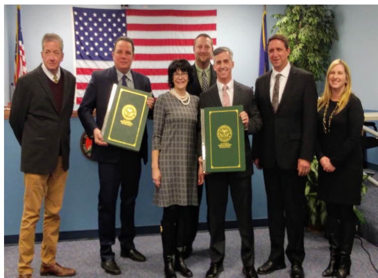
Falls Township Supervisors donated $5,000 to Bucks County's Deed Preservation Project

"They would record the sale and freeing the slaves in our books."