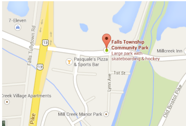
Mill Creek Road and Route 13