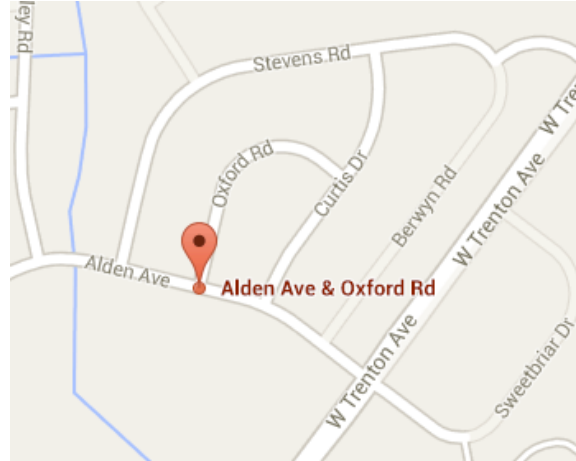
Alden Avenue and Oxford Road