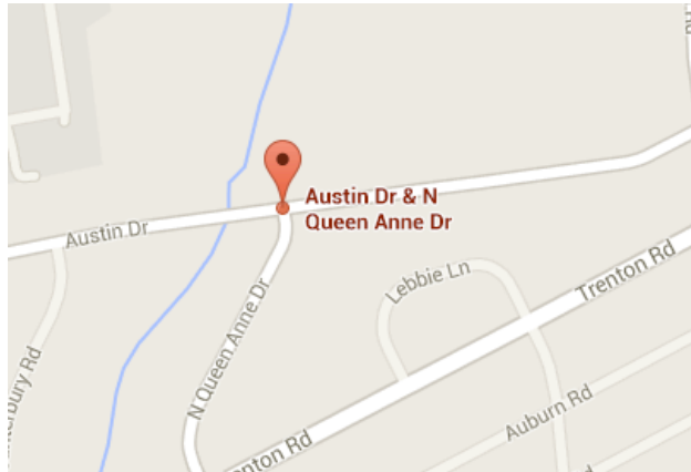
Austin Drive at Queen Anne Drive