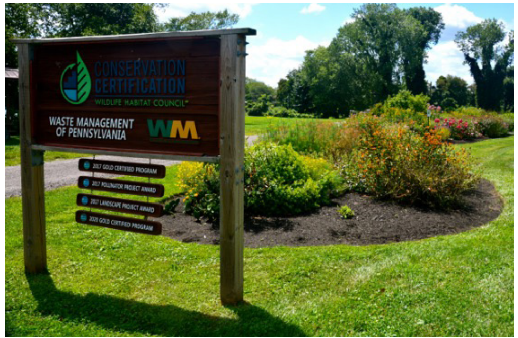
Waste Management of Pennsylvania Intergenerational Pollinator Project

The Awareness and Community Engagement Project was launched by eight Waste Management employees who wanted to improve conservation awareness among employees and in the community. The over-arching goal is to actively engage employees and the community in learning