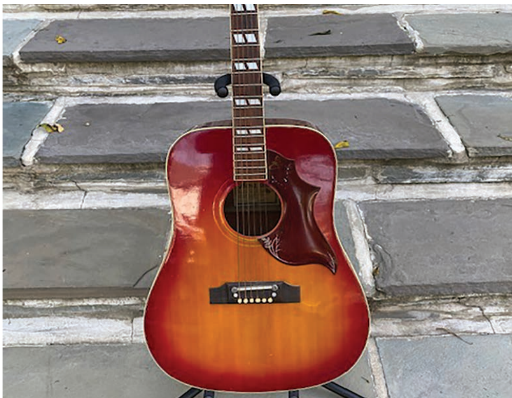
This guitar is one of many items to be auctioned off as part of the fundraiser.

During Historic Fallsington Day, the library will host a rummage sale, a book sale, and a bake sale, with all proceeds benefiting library programming. A craft involving succulents will also be available to visitors on Historic Fallsington Day, which runs 10 a.m. to 4:30 p.m. on Oct. 8.