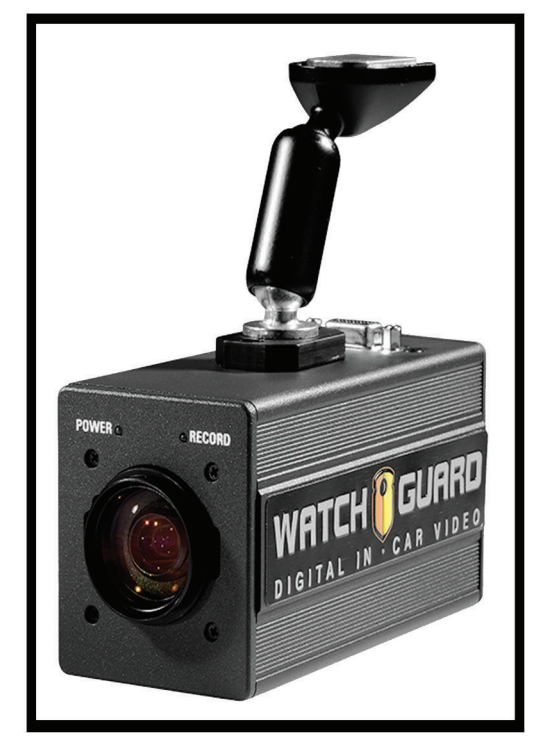
Dual front and rear in-vehicle cameras will be installed into two Falls Township police cruisers.