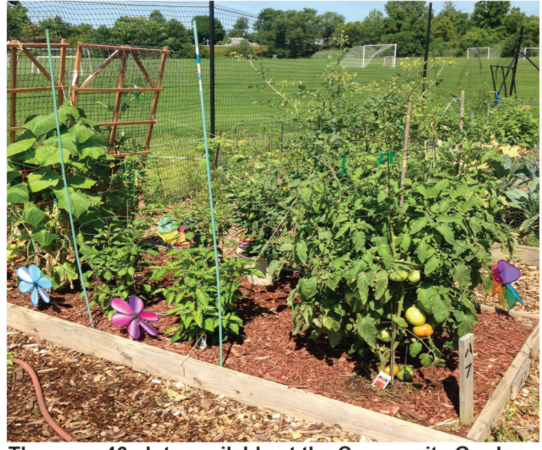
There are 46 plots available at the Community Garden.

he days are getting longer, temperatures are rising, trees are awakening from the winter slumber, and the garden section of the home centers are filling with live plants and seeds. It's springtime. If you are itching to dig in soil and plant tomatoes, peppers or your favorite flowers and have no place for a garden, the Falls Township Community Garden can help.