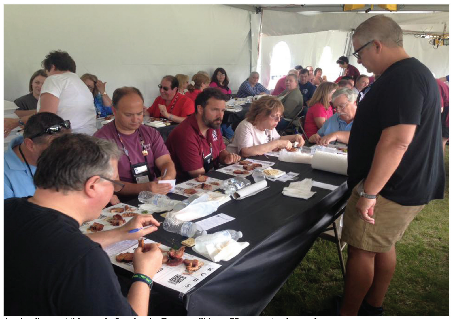
Lucky diners at this year's Que for the Troops will have 75 menus to choose from.