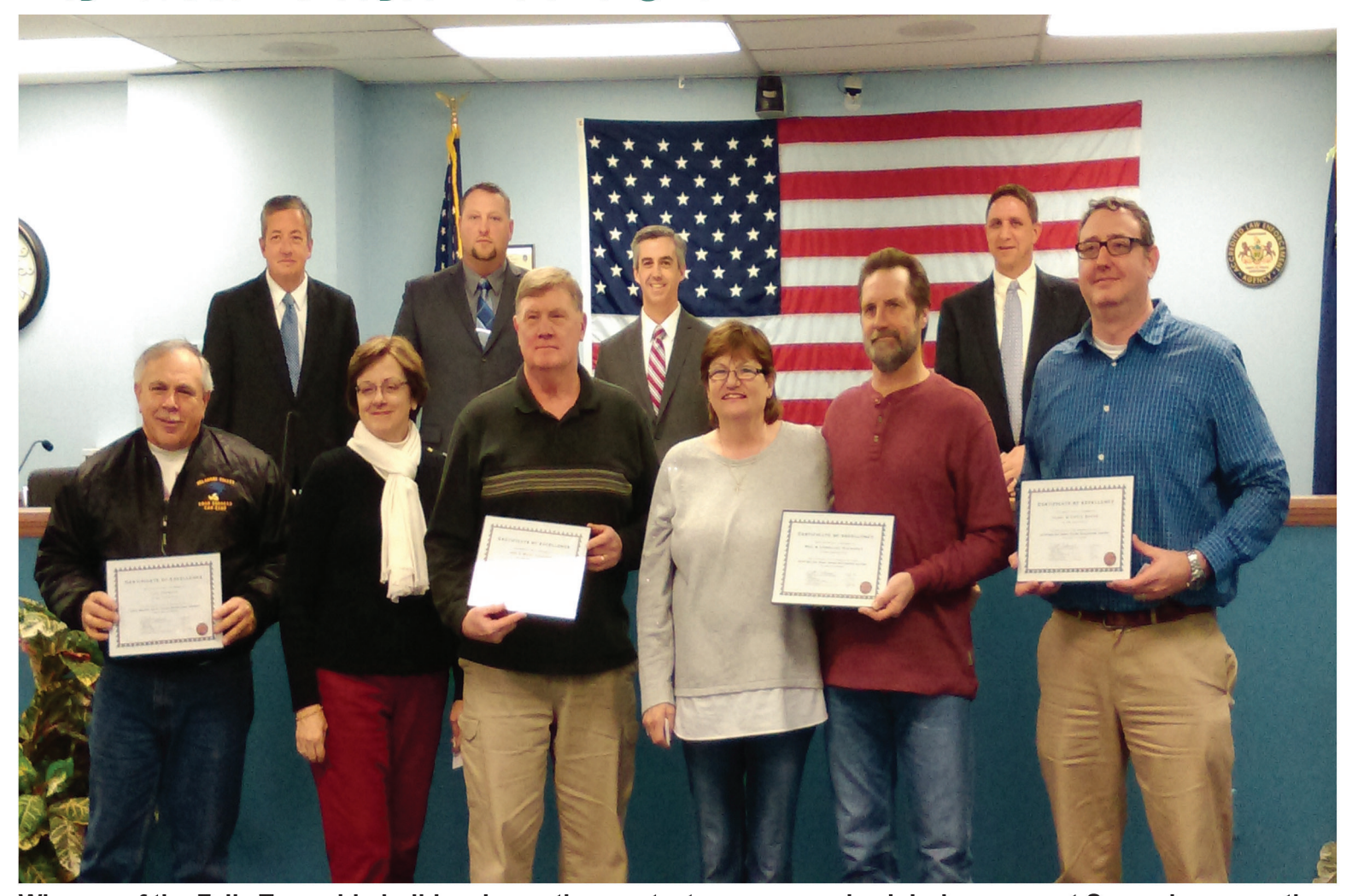
Winners of the Falls Township holiday decorating contest were recognized during a recent Supervisors meeting.