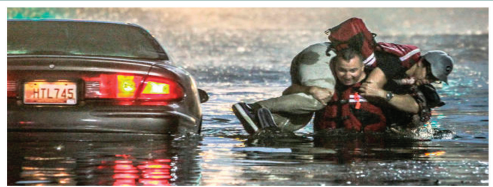
Penalties will be levied if motorists have to be rescued during flooding.

"We'd like to ease them in," the Chief said. "That way it's not a burden to the Township."