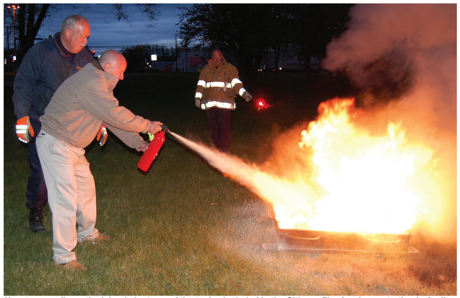
How to use a fire extinuisher is just one of the topics included in the Citizens Fire Academy, starting in April.