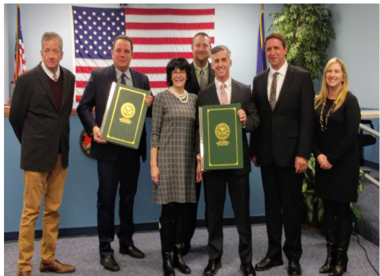
Falls Township Supervisors donated $5,000 to Bucks County's Deed Preservation Project