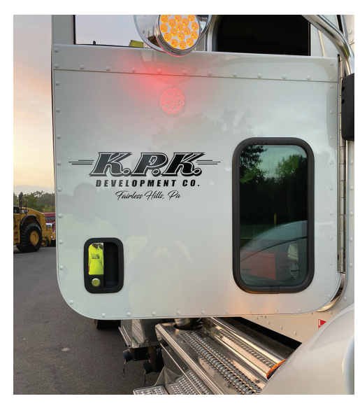
KPK Development, a proud co-sponsor.

Thanks to the generous contributions of more than two dozen local businesses, Falls Township's fourth annual Touch a Truck in September raised a combined total of $15,700 for The Barkann Fami-