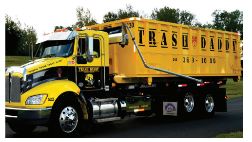
Trash Daddy, an event co-sponsor.

Park on Sept. 17 from 9 a.m. to 2 p.m. (with a Sept. 24 rain date). Several dozen trucks – from fire and emergency service, to mowers, heavy machinery, tow trucks, excavators and more – will be on display for guests to explore.