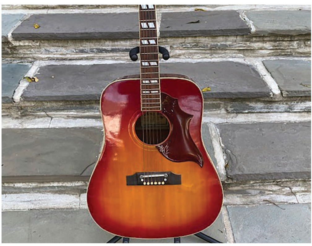
This guitar is one of many items to be auctioned off as part of the fundraiser.

During Historic Fallsington Day, the library will host a rummage sale, a book sale, and a bake sale, with all proceeds benefiting library programming. A craft involving succulents will also be available to visitors on Historic Fallsington Day, which runs 10 a.m. to 4:30 p.m. on Oct. 8.